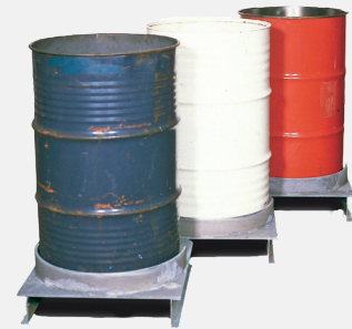
Standard drums can be used for storage and transport of the hazardous waste. Sorting is possible by using several drums.

It is easy to feed material into the open top-loading unit. The compactor is safe and simple to operate.