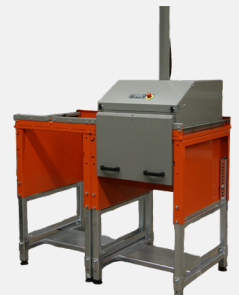
The multiple-chamber unit equipped with an apron with two handles