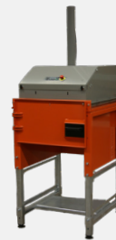
The single-chamber unit with swing door

The compactor is easily extended with additional chambers. The front door on the single-chamber unit is then replaced by an apron for effortless movement of the press head from one chamber to the next.