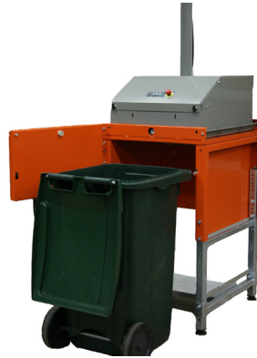
Designed to fit the standard 63 gal bins in the market.

Safety and quality are our hallmarks and the compactor provides maximum personal safety both for the operator and those in the immediate vicinity. A bin indicator assures that the machine can only start, when the bin is in the right position.