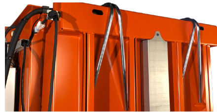
Pipes for easy bale strapping