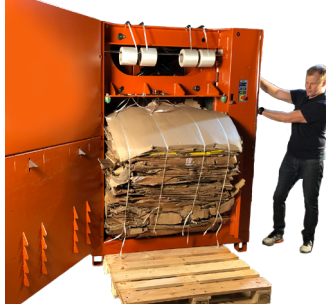
Simply push two buttons for bale ejection!

The baler is fast and with a cycle time of just 16 sec, it is ready for a new load of cardboard boxes or plastic foil in no time and auto start is a standard feature! 3220 can be operated manually but is preferably run in auto mode for maximum productivity and convenience.