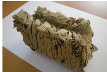
Small and compact briquette