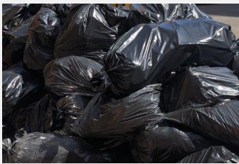
Full bags ready for collection