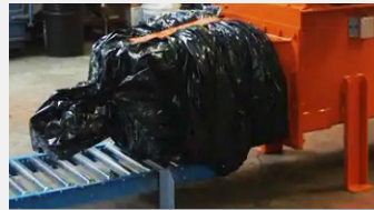
Nozzle and bag