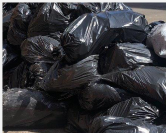
Compacted waste in bags ready for collection.

The bags conveniently drop down from the chute directly into the hopper of the compactor and thanks to a photocell the machine automatically starts compacting the waste.