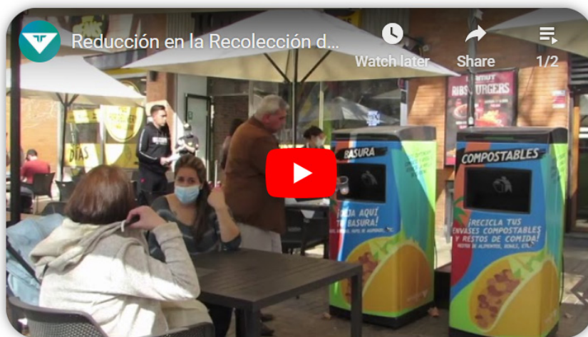
Watch the video (in Spanish) on YouTube