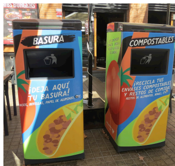
TOM in colorful customized wrappings