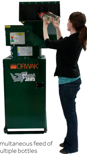
Simultaneous feed of multiple bottles

It dramatically reduces the labor cost associated with managing waste bottles, the frequency of glass collections required and the overall waste glass disposal costs for your business.