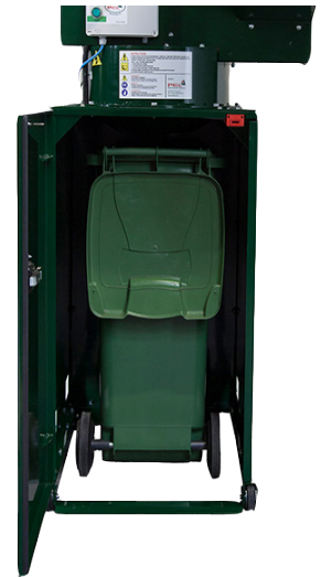
The broken glass/ cullet is safely collected in a 32 gal wheeled cart inside the machine.