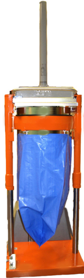
Emptying height, when the drum is hoisted, is 2660 mm with the standard B drum and only 2360 mm with the shorter C drum.

A compacted and well-sealed bag prevents leakage and odours. The machine is designed for easy daily cleaning and critical parts are made of stainless steel.