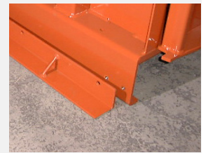
Skid mounting for bolting the machine to the floor