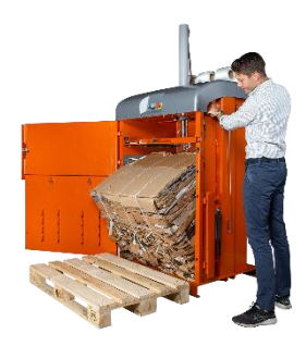
The new model 3120 featuring modern design, extra wide loading gate and semi-automated bale ejection