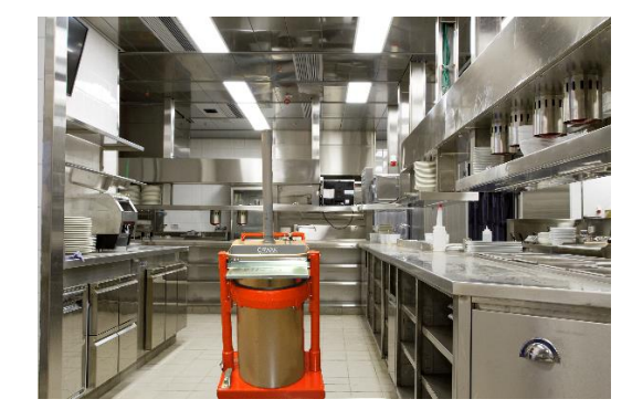
The classic 5030 today in new design and still a best seller in its niche

Over the years, the focus in the product range has shifted to vertical balers and automated systems. Orwak has always been in the forefront of innovation and develops new concepts and provides the market with innovative waste handling and recycling solutions. Since the beginning in the 70s, the Orwak machines have traveled far and wide and the installed base in the world is substantial. Our balers and waste compactors have reached every continent, even a research station in Antarctica!