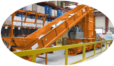
Option: conveyor belt

A completely automated waste management solution designed for continuous infeed, automatic horizontal or vertical strapping system with adjustable wire links, which enables you to yield optimal output.