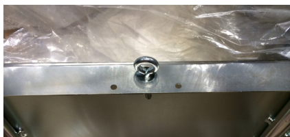
A pin keeps the bin attached to the trolley