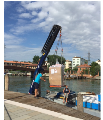
The Orwak baler is lifted ashore on the island